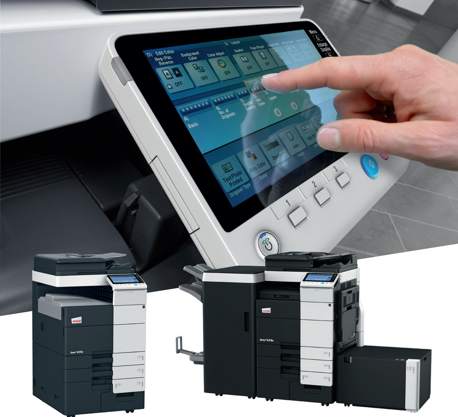
ineo+ 654e with output tray (OT-503)